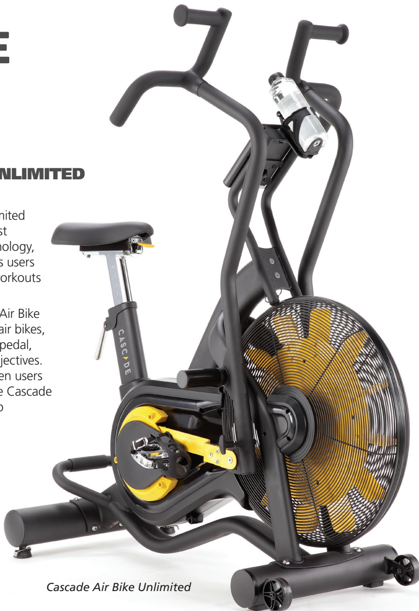
Cascade Air Bike Unlimited

Comfortable and easy to use, the Cascade Air Bike offers unlimited air resistance. Like with all air bikes, the individual controls the intensity as they pedal, push, and pull to meet their own fitness objectives. The large foot pegs also make it simple when users only want a great upper body workout. The Cascade Unlimited model is designed with multi-grip handlebars and pedals with cages.