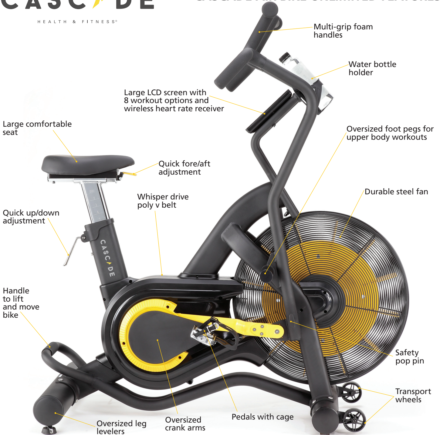
Cascade Air Bike Unlimited