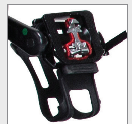
Optional Dual-Clip Foot Pedal