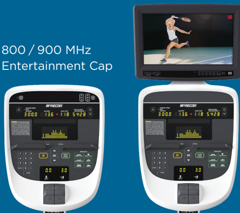
800 / 900 MHz Entertainment Cap