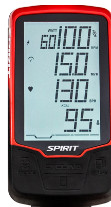
Wireless LCD Console with Bluetooth FTMS

The CIC850 is a high performance indoor cycle that is extremely versatile. Magnetic resistance, commercial grade Hutchinson poly-v belt, 4-way seat and handlebar adjustability, and heavy-duty three-piece crank provide a low-maintenance solution to your high-performance needs. The combination of a large LCD Bluetooth console and adjustable tablet holder allows users to use their phone or tablet to help train with 3rd party apps. Small dumbbells can be stored right under your seat for easy access during workouts and the dual water bottle holders keep hydration within reach.